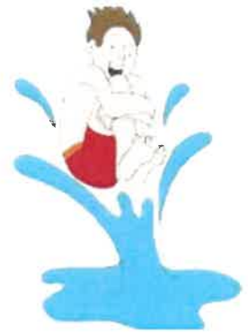
The jumping in the river is always exciting!